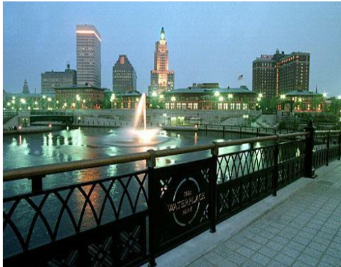
Waterplace Park, Providence