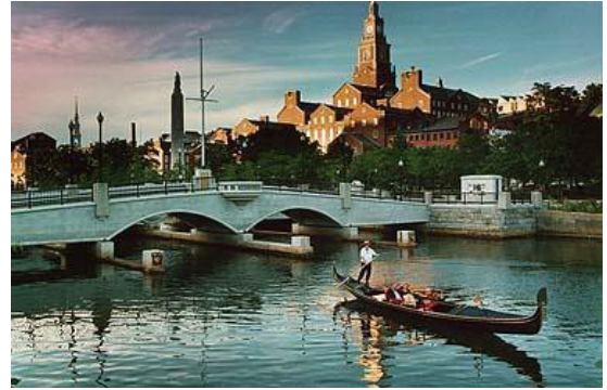
Revitalized Providence Waterfront

An employer who participates in the Bonus Program, which provides job training for former public assistance recipients, can qualify for a $250 tax credit per participant. A certificate of eligibility from the Rhode Island Department of Human Services is required.