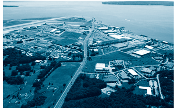
Quonset Business Park, North Kingstown

A manufacturer is allowed a 4% tax credit against the Rhode Island corporate income tax on buildings and structural components, as well as machinery and equipment, which are owned or leased and are principally used in the production process (including storage). Property principally used for administration and distribution purposes is not eligible. The investment tax credit may not reduce the taxpayer's liability below the minimum business tax. Unused credits may be carried forward for up to seven years.